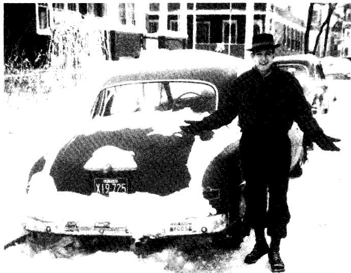
Talk About Snow